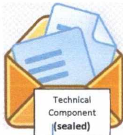
1st Envelope- Technical