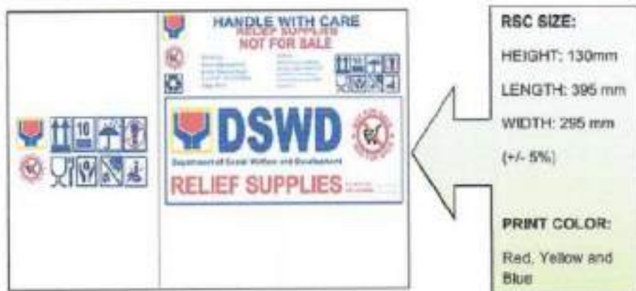
Side B, Illustration