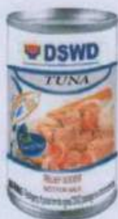
Canned Tuna Flakes